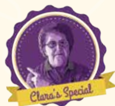
Steak & Eggs

Served with two eggs, hash browns, choice of pancakes, toast or biscuit & gravy and choice of hardwood smoked ham, links, country sausage patties, double-smoked bacon, or kielbasa. 10.59