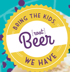
Root Beer Float

All day Wednesdays & after 3 PM on Sundays