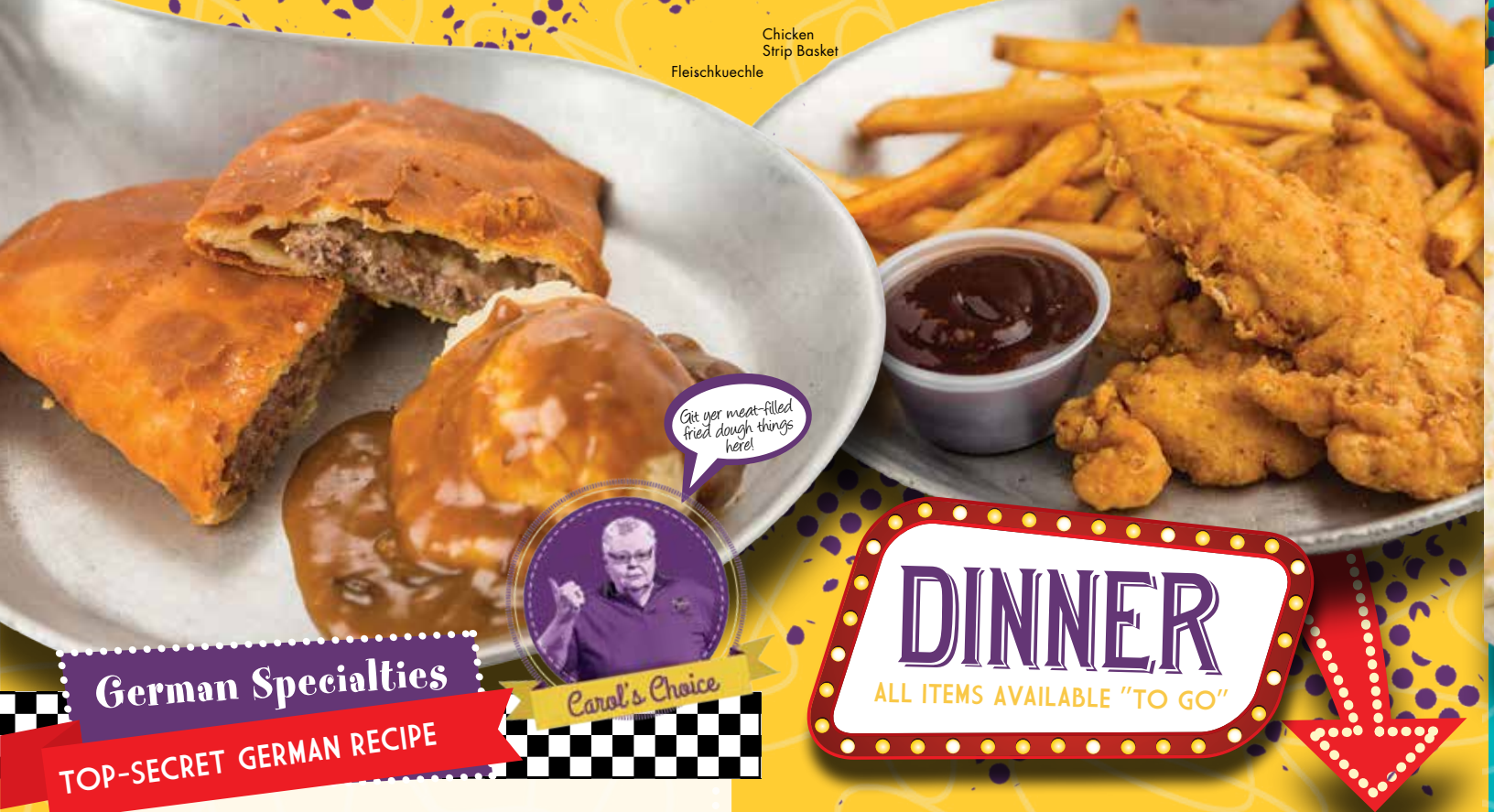
Chicken Strip Basket Fleischkuechle

Get yer meat-filled fried dough things here!