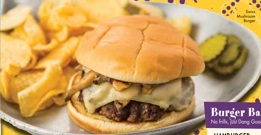
Swiss Mushroom Burger