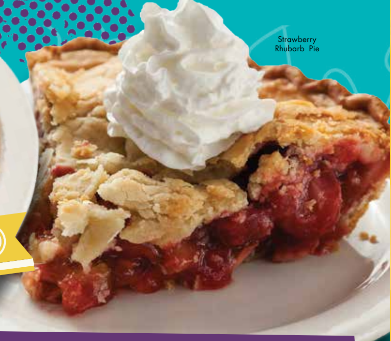
Strawberry Rhubarb Pie